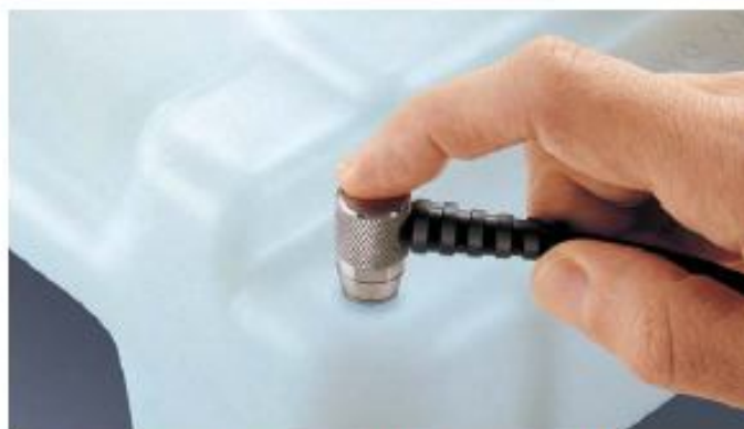
Measure the thickness of metal, plastics and more

Visit www.defelsko.com/applications.htm to view Inspection Application Notes