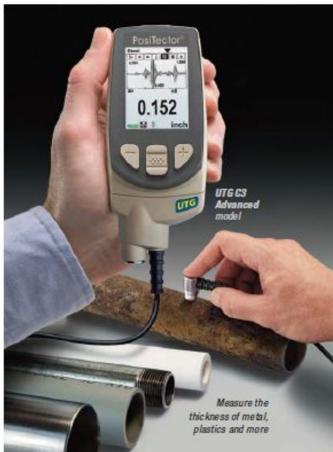
UTG C3 Advanced model