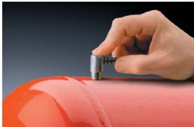
UTG M Multiple Echo Thru-Paint probe measures the thickness of a painted structure without having to remove the coating.